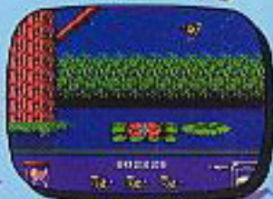
BEE 52 AND JUNIOR

When you blow him away he leaves behind a pick-up bubble. Fly into the bubble to get the pick-up.