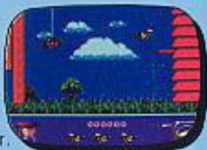
A TANGLED WEB

Who'd have thought that the success of major preserve distributor "Really Nice Honey" depended almost exclusively on one worker. Not a white or blue collar worker but a black and yellow-striped worker-you! A series of mishaps have befallen your co-workers and now it's up to you to ensure the continuing success of "Really Nice Honey".