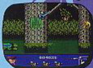
SKINNER IN ACTION

The relatively simple task of collecting the nectar from the flowers is made extremely hazardous by the motley gang of Ghastlies who attempt to chase, ambush you or just blow you away! These guys, coupled with unknown territory, certainly separate the men from the larvae!